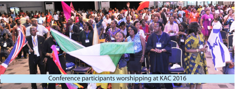
Conference participants worshipping at KAC 2016