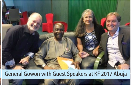
General Gowon with Guest Speakers at KF 2017 Abuja